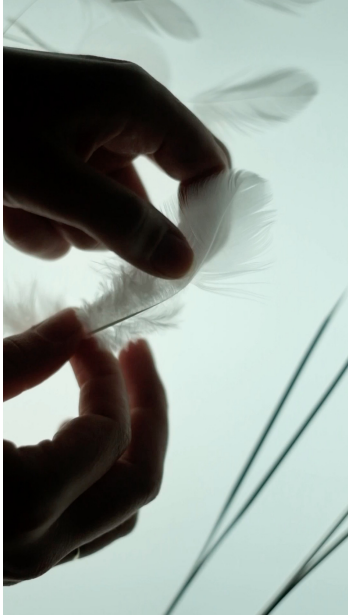
Figure 2: Feather preparation.

of textiles, augmented with electrically conductive feathers. Both the feathers augmenting the textile, and the feathers of the original Stymphalian Birds thwart our expectations: though the feathers themselves might appear mundane, their material properties make them extraordinary.