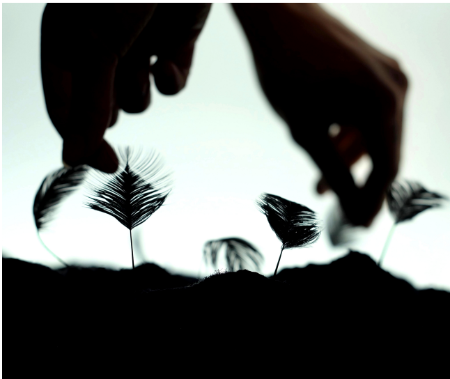
Figure 1: Installation made of Stymphalian textile.